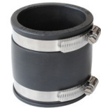
1056 Flexible Couplings